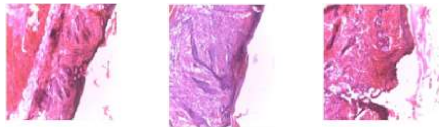
Figure 1. Histological structures of healed skin wounds on day 14 of pre wounding (stained with hematoxylin and eosin X 10). A=Control (Pre-treated), B=Pre-treated (100 mg), C=Ketoconazole.