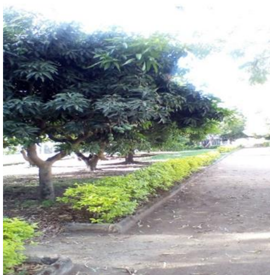
Plate 2. Trees and shrubs used in boundary demarcation

The shade of trees is welcomed by man and beast alike, providing essential shelter in the hottest climates (See Plate 3). Trees are often used as windbreaks to shelter sensitive crops (A Handbook of Landscape, 2013). Example is Caesalpinia pulcherrima , Tectona grandis , Terminali catappa