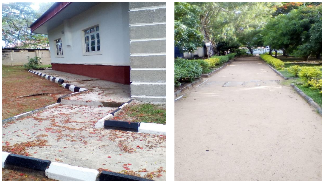
Plate 4 & 5. Use of hard scape and soft scape elements to define the pedestrian walkways