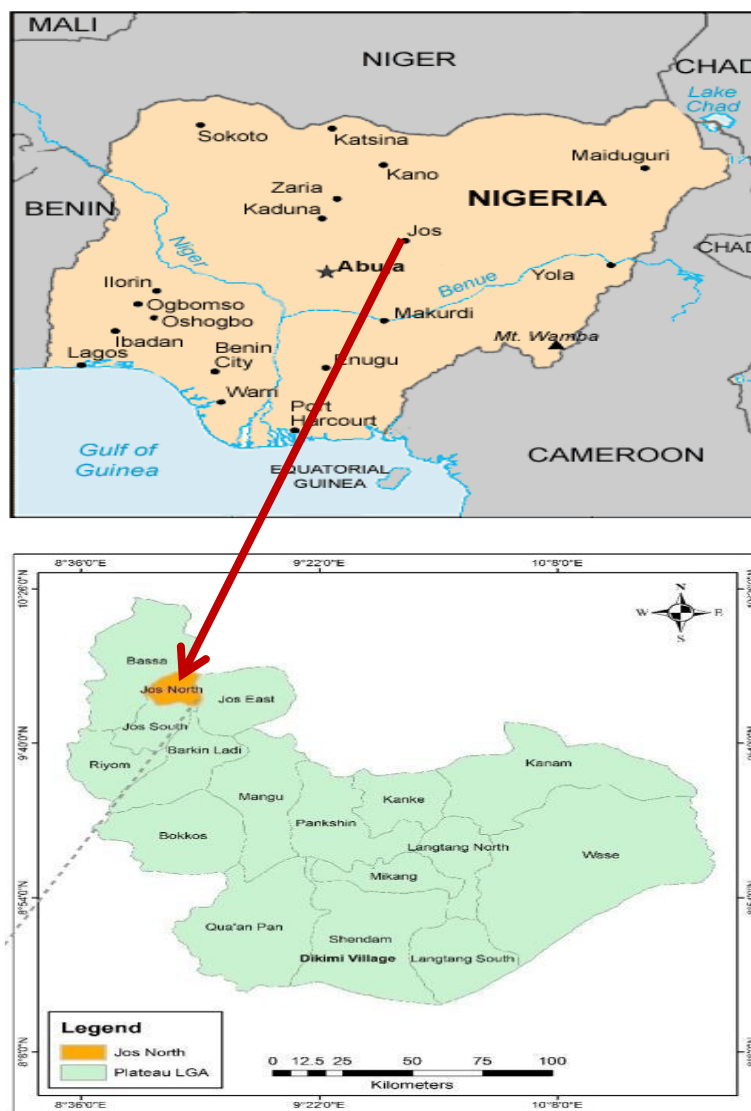
Figure 3. Map of Nigeria (top) showing Jos and Map of Plateau State (down) showing Study area. Source: Adapted from Orewere, et al. , 2019.

Jos plateau, is located in the central part of the country between latitude 8° 30' and 10°30' N and longitude 8° 20' and 9° 30'E, (See Figure 3) with a surface area of about 9,400km 2 . It has an average elevation of about 1,250 metres above sea level and stands at a height of about 600 metres above the surrounding plains (Archives of Library and Documentation Unit FCF, Jos, 2018).