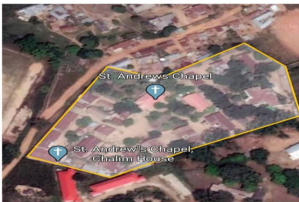
Figure 2. Google Earth Map of Housing Estate (Chalim), Jos

The study area is Chalim Housing Estate, Jos located along Bauchi road and opposite Bauchi Motor Park. The estate is bounded by University of Jos senior staff quarters along Bauchi road by the east and with Department of Fisheries by the west, while Bauchi road that leads to University of Jos main campus passes the Federal College of Forestry, Jos from south-north. The housing estate is in the city of Jos in Jos North Local Government Area of Plateau State (See Figure 2) (Archives of Library and Documentation Unit FCF, Jos, 2018).