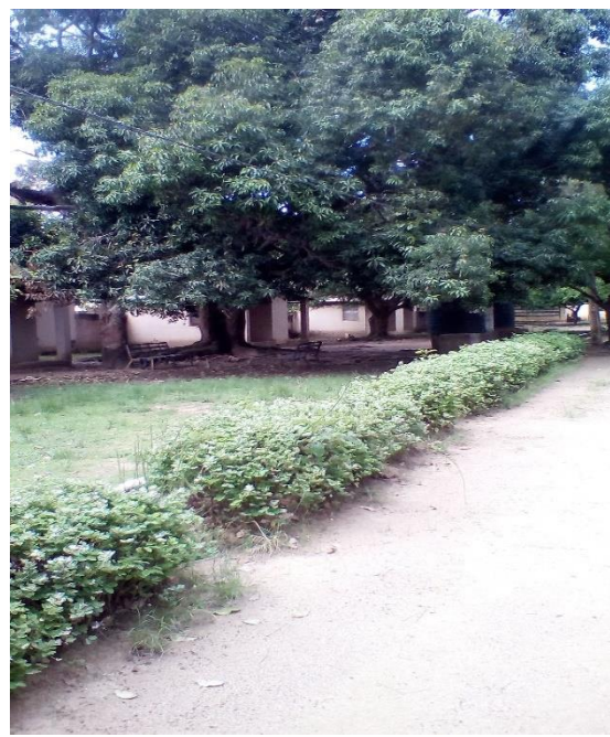
Plate 1. Trees, shrubs and lawn which beautify the environment and provide shade