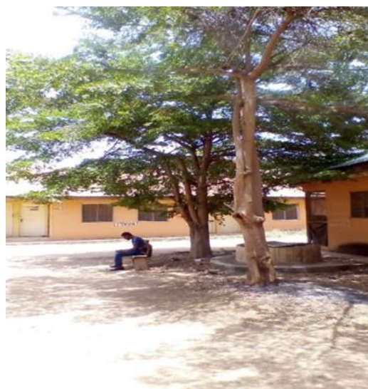
Plate 3. Shelter provided from vegetation (Trees)