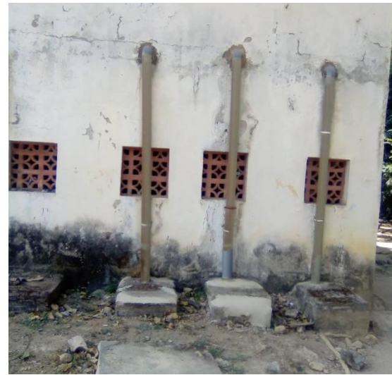
Plate 4: Exposed pipes to inspection chamber

Students' perception of electricity, firefighting equipment, and laundry services were ranked high while toilet facilities, security and water supply were ranked least available. The facilities ranked least available are inadequate in number for use and positioned far from hostels. The findings are in line with the studies of (Ajayi, et al. , 2015; Rotowa, et al. , 2016) of Nigeria which reveals that students are dissatisfied with hostels' location of bathrooms as well as cleanliness and an inadequate number of kitchenette facilities of Federal University of Technology, Akure, Nigeria.