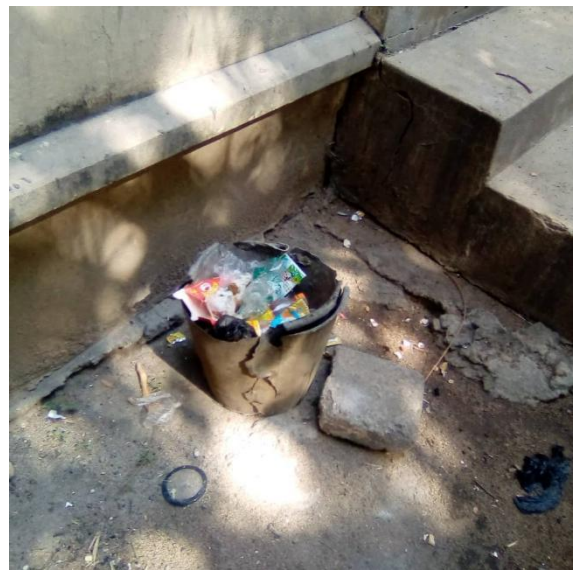
Plate 2: Disposal of wastes in open spaces