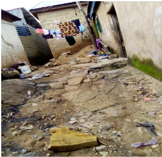
Plate 3: Condition of physical environment