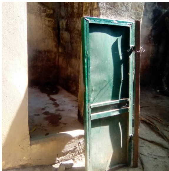
Plate 1: A door hanging on its hinges